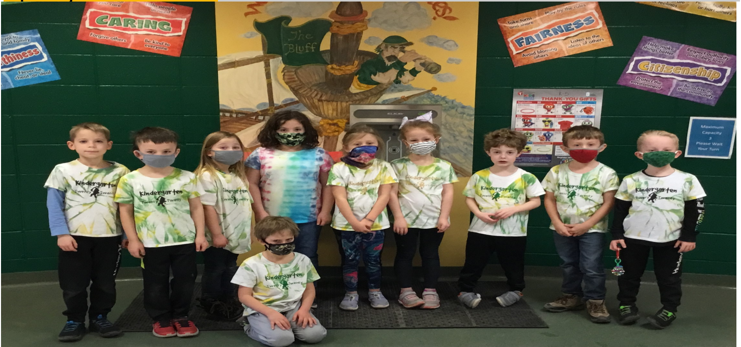
Kindergarten and Fourth grade students are dressed to impress in their tie dye shirts!